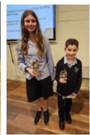
Finalists and Winners